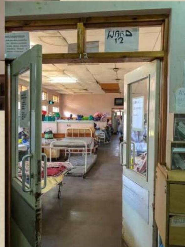
In-patient Ward with Nursing Charting Area