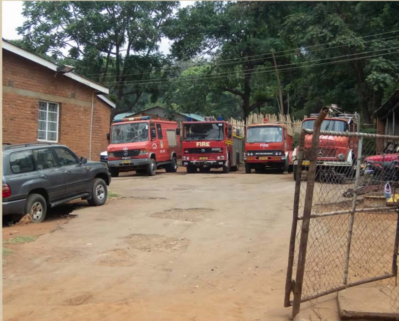
Zomba City Fire Response Equipment