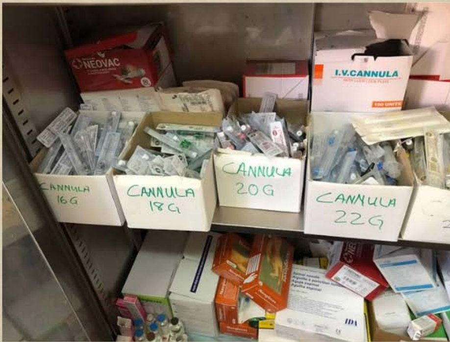
Supplies stored in Operating Room