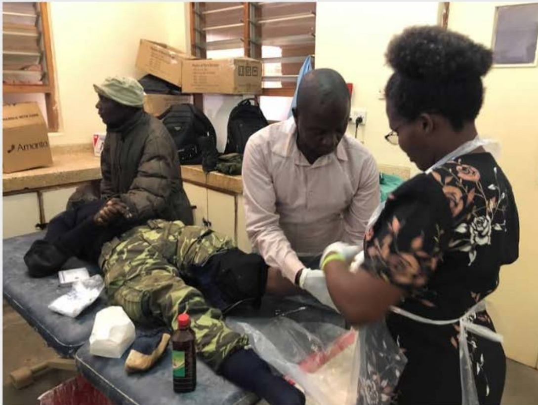
Government Ranger Injured in Line of Duty