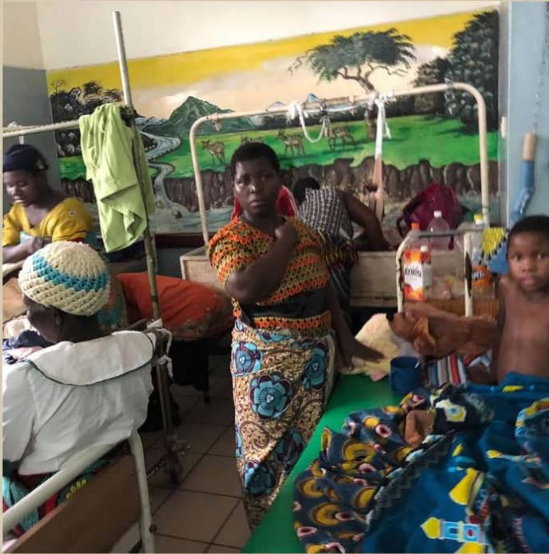
In-patient Pediatric Ward