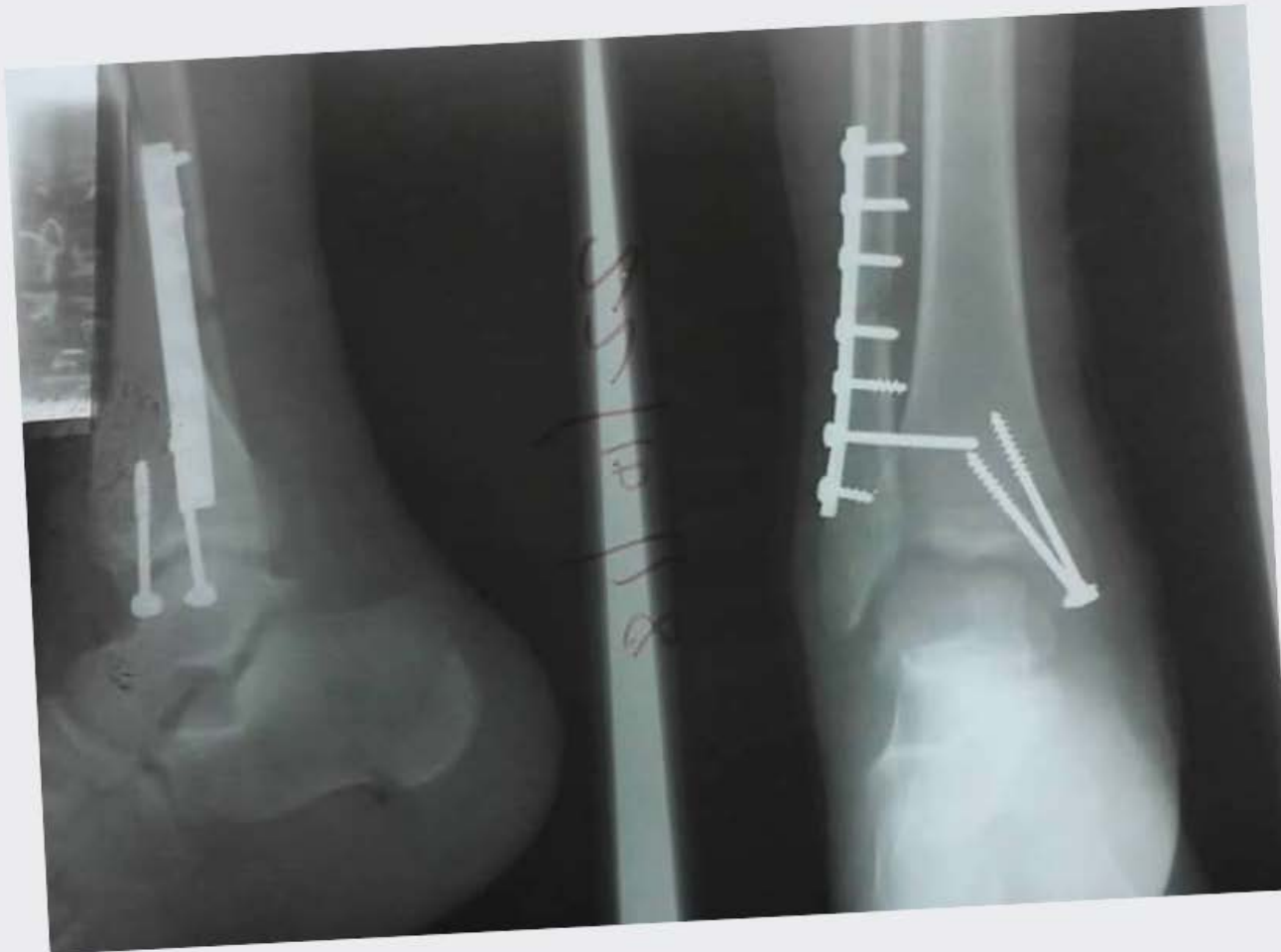
Post-operative Xrays Images