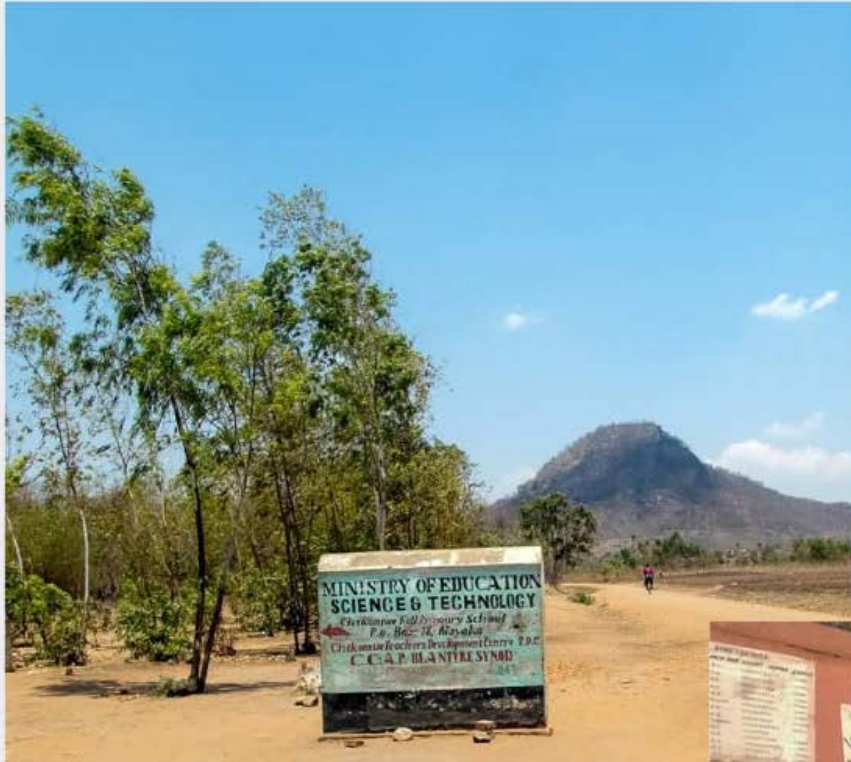
Chikomwe School 45 KM from Zomba City 30 of the KM unpaved!